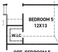
OPT. BEDROOM 5 ILO GAME ROOM