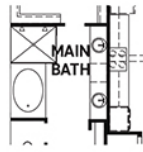
OPT. ENLARGED MAIN SHOWER