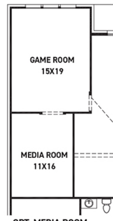
OPT. MEDIA ROOM @ COURTYARD (ONLY WITH GAME ROOM) +181 SQ. FT.