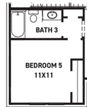
OPT. BEDROOM 5 W/ BATH 3 @ LIVING