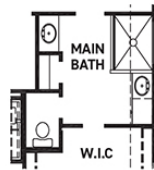
OPT. ENLARGED MAIN SHOWER