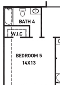
OPT. BEDROOM 5 W/ BATH 4