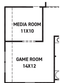
OPT. MEDIA ROOM