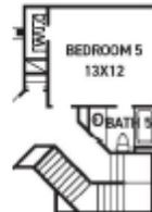
OPT. BEDROOM 5 W/ BATH 5