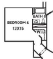
OPT. BEDROOM 6 W/ BATH 6 +298 SQ. FT.