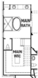
OPT. 2 STORY MAIN CLOSET