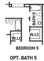
BEDROOM 5 OPT. BATH 5