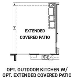
OPT. OUTDOOR KITCHEN W/ OPT. EXTENDED COVERED PATIO