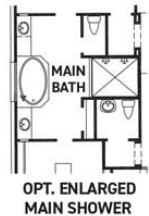
OPT. ENLARGED MAIN SHOWER