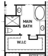
MAIN BATH W/TUB OPT.