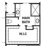
MAIN BATH W/ SPLIT VANITY OPT.