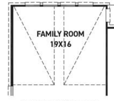
OPT. POINTED VAULT OPT. ARCHED VAULT