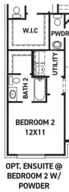
OPT. ENSUITE @ BEDROOM 2 W/ POWDER