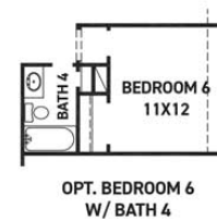
OPT. BEDROOM 6 W/ BATH 4