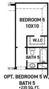
OPT. BEDROOM 5 W/ BATH 5 +235 SQ. FT.