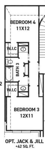
OPT. JACK & JILL +42 SQ. FT.