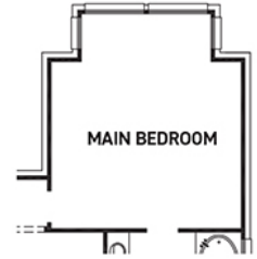
OPT. MAIN BOX BAY +50 SQ. FT.