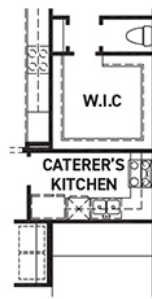
OPT. CATERER'S KITCHEN +73 SQ. FT.