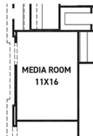
OPT. MEDIA ROOM @ DINING