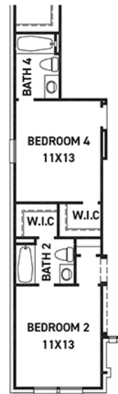
OPT. BATH 4