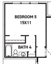
OPT. BEDROOM 5/BATH4 @ GAME ROOM