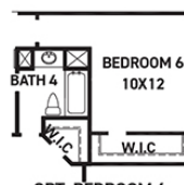
OPT. BEDROOM 6 ILO MEDIA ROOM