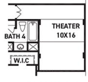
OPT. THEATER ILO MEDIA ROOM