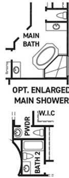
OPT. ENLARGED MAIN SHOWER OPT. POWDER