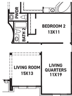
OPT. LIVING QUARTERS +240 SQ. FT.