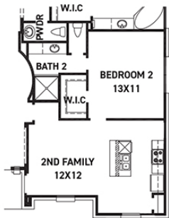
OPT. DUAL HOME +240 SQ. FT.