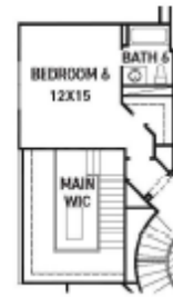
OPT. BEDROOM 6/BATH 6 W/ OPT. 2 STORY MAIN CLOSET +298 SQ. FT.