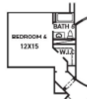
OPT. BEDROOM 6 W/ BATH 6 +298 SQ. FT.