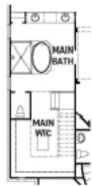
OPT. 2 STORY MAIN CLOSET