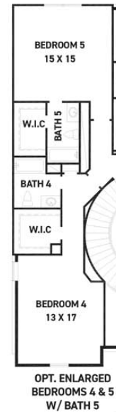
OPT. ENLARGED BEDROOMS 4 & 5 W/ BATH 5