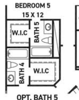
OPT. BATH 5