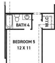
OPT. BEDROOM 5 W/BATH 4