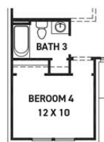
OPT. BEDROOM 4/ BATH 3 @ LIVING