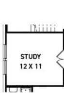
OPT. STUDY @ DINING