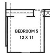
OPT. BEDROOM 5