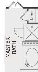
OPTIONAL MASTER BATH