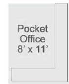
OPTIONAL POCKET OFFICE