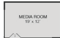
OPTIONAL MEDIA ROOM