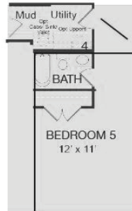
OPTIONAL 5TH BEDROOM ILO FLEX SPACE/PWDR BATH